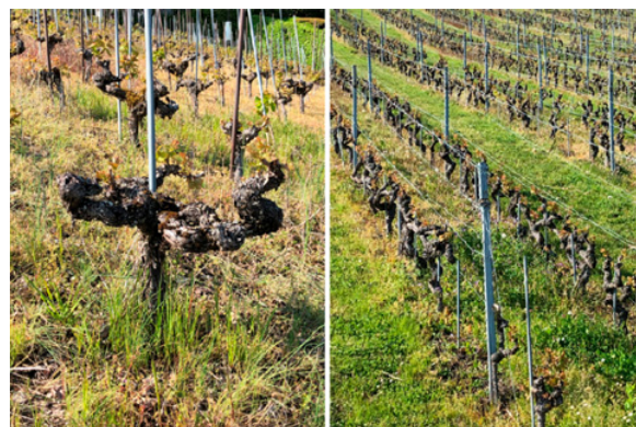
Figure 2. The high density Gobelet system (left) compared to wire-trellised spur-pruned vines with lower plant densities.

In Switzerland all vineyards were planted with high plant densities of 10,000 to 12,000 vines per hectare, each one trellised on a picket (Gobelet) and managed by hand (Fig. 2). The overall work, rises more than 1500 hours per ha per year. Today this cultivation system represents less than 5% of the growing area. Soil management to control weeds belongs to the most fastidious operation when made by hand. In this context, the first dinitro-ortho-cresol (DNOC) and triazine herbicides (simazine and atrazine) or 2,4-dichlorophenoxyacetic acid (2,4D), later diquat and paraquat developed in the fifties represented a real revolution for the growers. The general rule was to clean weeds on the whole surface with high erosion risks