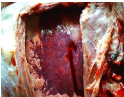
Fig. 2. Lung lesions with red sealing areas.

The calf was found to have hyperemia of the lung with areas of red seal (Fig. 2), surrounded by a zone of emphysema. The mucous membrane of the trachea, bronchiol and bronchiol was hyperemiatized and covered with muco-purulent exudate (Fig. 3).