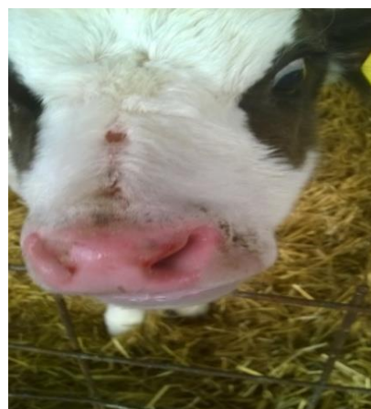
Fig. 1. Sick calf with signs of respiratory disease

In wintertime, one of the dairy complexes of the Republic of Tatarstan registered an outbreak of respiratory disease among calves of 1–3 months of age. Clinical signs of the disease were characterized by an increase in body temperature up to 41–42 °C, depression, dyspnea, serous-mucosal discharge from the nose, eyes, diarrhea and refusal of food was observed in some animals (Fig. 1).