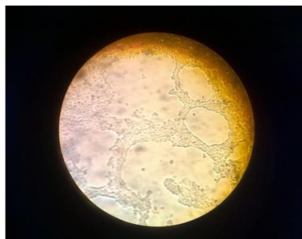
Fig. 4. LD-9 isolate CPE on bovine kidney cell culture.

In order to isolate etiological agents, suspensions of clinical and pathological materials taken from sick calves and fallen animal, they infected the bovine kidney cell culture. It should be noted that the cytopathogenic agent ("LD-9") was isolated on the second passageway, which caused degenerative changes in the monolayer for 98–124 hours. The CPE of the isolate "LD-9" on the monolayer of the cell culture was characterized by the formation of syncytium and vacuoles (Fig. 4). In the following passages, the cytopathic effect was reduced to 72 hours.