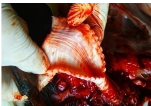
Fig. 3. Hyperemia of the tracheal mucosa.

In order to make a diagnosis of respiratory disease, retrospective studies of 12 serum samples from 1 to 3-month-old patients and recovered calves were performed in the HGIT. The results of the studies are presented in Table 2.