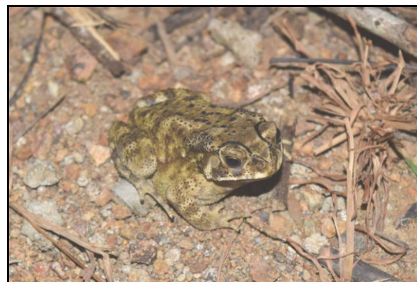
Fig. 2 Duttaphrynus melanostictus in Sape, Sumbawa island

The widespread presence of species such as F. cancrivora and D. melanostictus usually occurs because of carried accidentally by human and established in the area. The introduction of a species to a location outside its natural distribution does not always result in the successful establishment of this species outside its natural habitat. Based on the ten rules of Williamson & Fitter [25], the possibility of introduced species becoming invasive species is very small; in other words, it is difficult to detect the negative impacts of introduced species. To estimate the long-term impact of an invasive