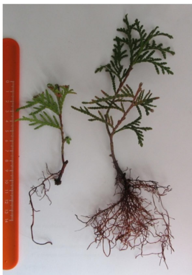
Fig. 3. Influence of auxin and nanoparticles of biogenic ferrihydrite on the development of rooted cuttings: on the left – the cutting treated with IAA, on the right – the cuttings treated with IAA + Feh composition

The effectiveness of treatment of Western thuja cuttings with biogenic ferrihydrite nanoparticles is confirmed by the results of rooted cuttings rearing. Rooted cuttings were grown for 1 year in containers with a volume of 0.5 liters. The development of plants is demonstrated by the photo of typical samples of the obtained seedlings, shown in Fig. 3.