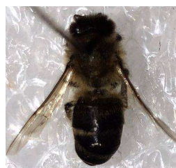
Fig. 1. Worker honey bee specimen

The study objects are the imagos of honey bees – workers (Fig. 1).