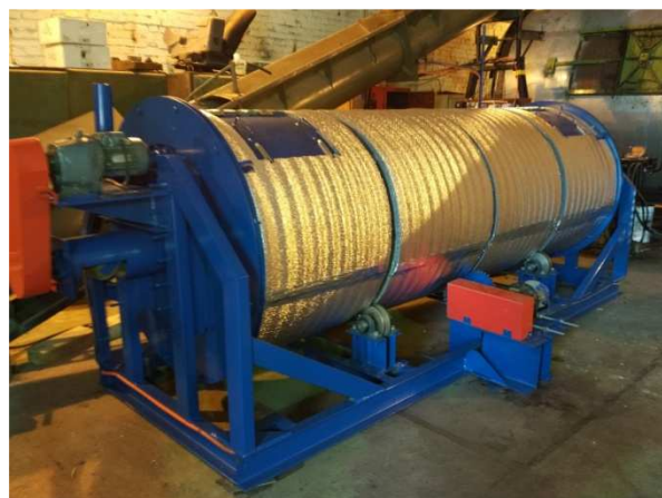
Fig. 6. Drum fermenter, BIOCON-AGRO, Russia

According to the fermentation device type, there are drum (Fig. 6) and chamber (Fig. 7) biofermenters. The heating process in them is provided by creating the comfortable conditions for the life activity of microorganisms. Biofermenters have significantly lower operating costs against the drying units. The resulting product has the higher moisture content : the one coming from a drum fermenter – up to 50 % ; the one coming from a chamber fermenter – up to 60 % . However, fermenters feature a longer processing time: drum fermenters – 3–4 days, chamber fermenters – 7–9 days .