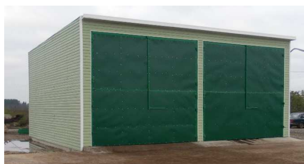
Fig. 7. Chamber fermenter, BIOZEM, Russia

The thermal drying is provided by supplying the heated air to the dryer drum, the drum rotation, gas removal and forced exhaust gas ventilation. Figure 8 shows the installation for animal/poultry manure drying.