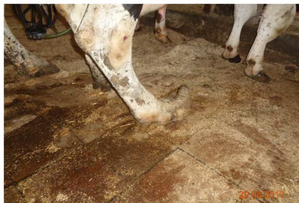
Fig. 4. A cow with deformed hooves

Analysis of the results of surgical medical examination for diseases in the distal segments of limbs indicates a significant effect of the animal housing system, including the use of bedding, on the incidence of surgical limb diseases.