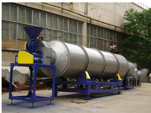
Fig. 8. Drying installation, TEPLOPROCESS, Russia

agricultural application of thermal drying a low-return technology [3].