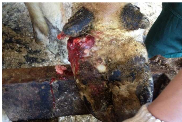
Fig. 3. Rusterholz Ulcer

Housing of cows without any bedding is one of the etiological factors of Pododermatitis Circumscripta (Rusterholz ulcer) (Fig. 3), which may affect up to 56 % of the herd [19].