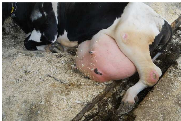
Fig. 5. Ulcers on the lateral surface of the knee and tarsal joints

For example, the high moisture content of bedding is one of the key factors in the development of purulonecrotic lesions of cow limbs (Fig. 5).