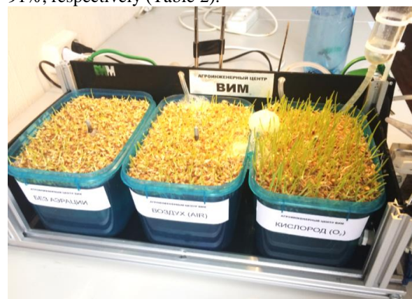
Fig. 2. Sprouts of spring wheat cultivar ‘Ivolga’ on the 3rd day after sowing (from left to right: without aeration, air saturation, oxygen saturation)

An increase in the root suction surface accelerated the development of the overhead parts of plants: the average height of the wheat plants increased by 29 % with air saturation and 64 % with oxygen saturation, the average height of the lentil plants increased by 64% and 91%, respectively (Table 2).