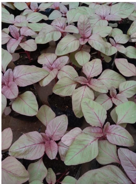
Fig. 1. Amaranthus tricolor L. plant on polybag.