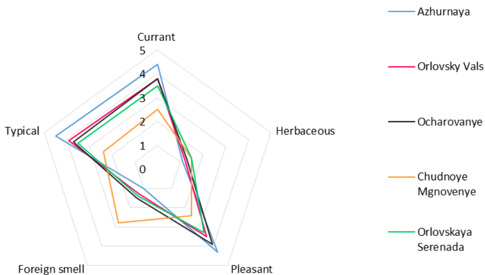
Fig. 3. Characteristics of the aroma of blackcurrant juices. The statistically significant difference between varieties is confirmed by the data of analysis of variance and Tukey's test

The rest of the varieties practically did not differ in both astringency and bitterness of the juice and were statistically at the same level. Taste indicators often depend on each other. For example, a sweet taste can mask acidity and bitterness. At the same time, the intensity of taste positively correlates with sour taste and negatively - with bitter, which is noted by other researchers [7].