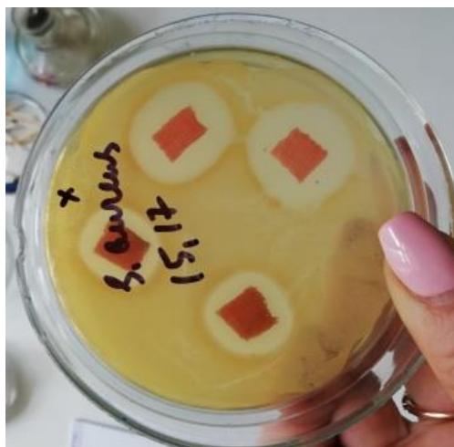
Fig. 2. Growth retardation of S. aureus colonies by fragments of dyed fabric, with fixations with silver salt.

0 - original unpainted fabric; 1 - fabric dyed using direct dyeing technology; 2 - fixation with zinc salt; 3 - fixation with copper salt; 4 - fixation with silver salt; 5 - fabric "4" after one wash; 6 - fabric "4" after five washes; 7 - fabric "4" after 10 washes.