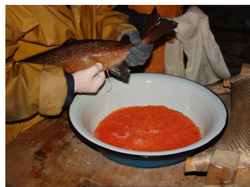
Fig. 1. Eggs fertilization.

Eggs and sperm are only collected from those spawners that are in good health and whose eggs and sperm are mature (fluid).