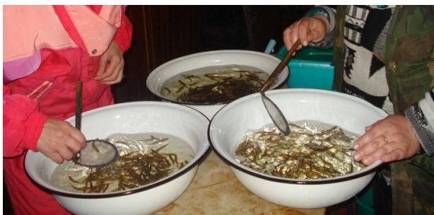
Fig. 4. Tagging of juveniles.

In order to be able to determine how many fish have come back to hatchery, juveniles to be released are tagged at the hatchery by amputating their fat fin (Figure 4.).