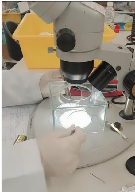
Fig. 1. Sorting process under microscope

After the drying process, the petri dish containing dried filter paper was placed under a glass box to control contaminants before viewed under light microscope. Next, both hands are inserted inside the hole of a glass box as shown in Figure 1 and microplastics taken one by one using forceps and placed on the new filter paper. The physical characterization of the microplastics such as color and shapes were recorded during the sorting process. In case of doubt, the Hot Needle Test was applied to the sample. A hot needle test is a technique to classify microplastic and non-microplastic. The new filter paper was placed in a new petri dish and covered with a lid and was kept again in the desiccator before chemical characterization process.