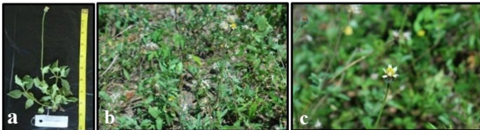
Fig. 5. Tridax procumbens . a. & b. habitus, c. inflorescence

The diagnostic characteristics of Tridax procumbens is herbs, caulescent, decumbent. Stems procumbent, glabrous, to 50 cm. Leaves shortly petiolate, ovate to ovate-lanceolate, margin irregularly serrate. Inflorescence terminal. Flower complete, perfect. Capitula solitary, long peduncle to 30 cm, subcampanulate. Phyllaries seriate, glabrous, outer densely greyish white, inner purple, elliptic. Ray florets 3-6, white. The disk florets yellow. Achenes brown [17].