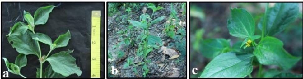
Fig. 4. Synedrella nodiflora , a. & b. habitus, c. inflorescence

The diagnostic characteristic of Synedrella nodiflora is herbs. Stem erect or ascending to 80 cm. Leaves opposite, cauline, blade ovate, 3-veined, margin toothed. Inflorescence axillary and terminal. Flower complete, perfect. Capitula radiate, sessile, solitary, cylindric to campanulate. Phyllaries persistent, 2-5+, 1 (or 2)-seriate. Ray florets and Disk florets corollas yellow [17].