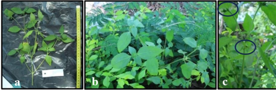
Fig. 3. Eleutheranthera ruderalis , a. & b. habitus, c. inflorescence