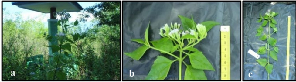
Fig. 1. Chromolaena odorata , a. & c. morphology, b. inflorescence

The diagnostic character of Chromolaena odorata is bush or shrub to 3 m. Stem erect, branch opposite. The leaves opposite, ovate-lanceolate, have three veins on the part base, and the margins coarsely dentate to the subentire. Inflorescence terminal. Flower complete, perfect capitula numerous in corymbs or compound corymbs, cylindric, discoid. Phyllaries 3- or 4-seriate. Corollas white. Achenes black-brown [17].