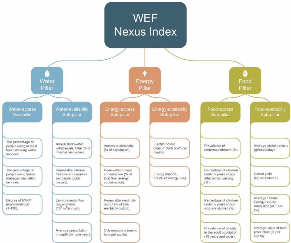
Fig. 2 A schematic representation of the WEF Nexus Index, with its constituents pillars, sub-pillars, and indicators. Source ( https://wefnexusindex.org )

Organizations like national statistical offices, government departments, non-governmental organizations, and international organizations like the World Bank, FAO, and others are all involved in the collection of data globally. Special national data can be collected and provided by national organizations.