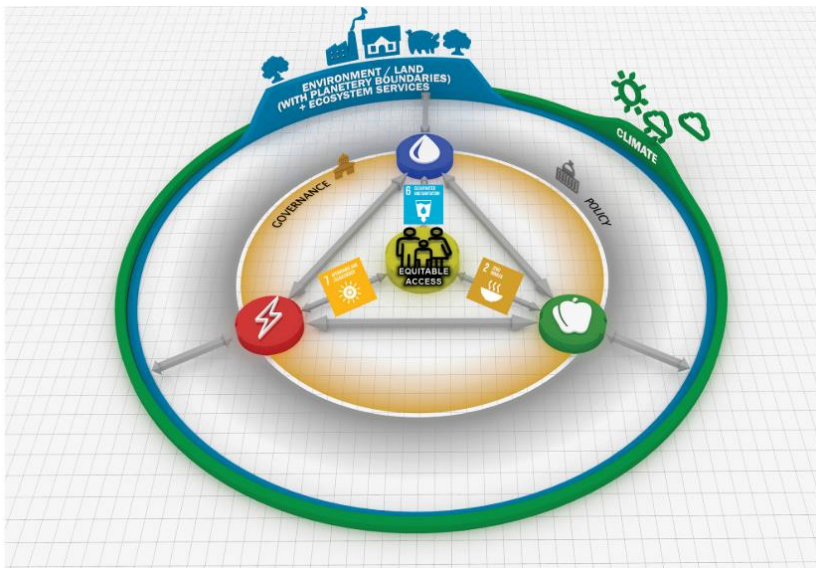
Fig. 1. The Anthropocentric WEF nexus framework

A composite indicator or index is created to provide a comprehensive view of the context being examined, for example, the WEF nexus [3]. The WEF Nexus Index value serves as a reflection of a country's level of equitable access to and availability of these three critical resources [6]. This paper's objective is to evaluate how the WEF Nexus Index has performed in the past five years, focusing on comprehending the interdependent and intricate nature of the Climate-Water, Energy, and Food Security systems in Morocco. The purpose of this study is to illustrate the WEF Nexus Index's variability and its application for WEF linkage assessments.