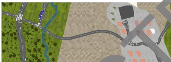
Fig. 1. Fragment of two-dimensional simulation model of transportation flows between production and finished goods warehouse

Based on the results of the research, the parameters and characteristics have been determined to characterize the transport flows occurring between the drinking water production facility to the warehouses or distribution centers that sell the products produced. Fig. 1 shows a fragment of a two-dimensional simulation model corresponding to the terrain over which the studied transport flows are realized (located in the Orenburg Oblast, Russia).