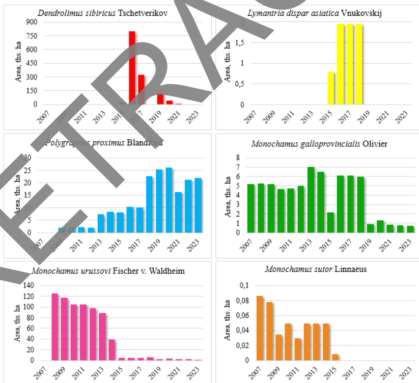
Fig. 2. The size of the area affected by the outbreak of pests classified as quarantine species (by insect species)

Among the insect pests classified as quarantine species in Krasnoyarsk Krai over the course of several years, the most prevalent are the Siberian moth (2016 – 57,1 %, 2016 – 97,2 %, 2017 – 93,3 %, 2019 – 81,1%, 2020 – 50,8 % of the total area of outbreaks), the four-eyed fir bark beetle (2018 – 62,9 %, 2021 – 75,0 %, 2022 – 87,9 %, 2023 – 89,9 %), and the black fir sawyer beetle (2008 – 95,9 %, 2009 – 94,2 %, 2010 – 94,9 %, 2011 – 93,7 %, 2013 – 85,8 %, 2014 – 72,4 % of the total area of outbreaks) (Figure 2).