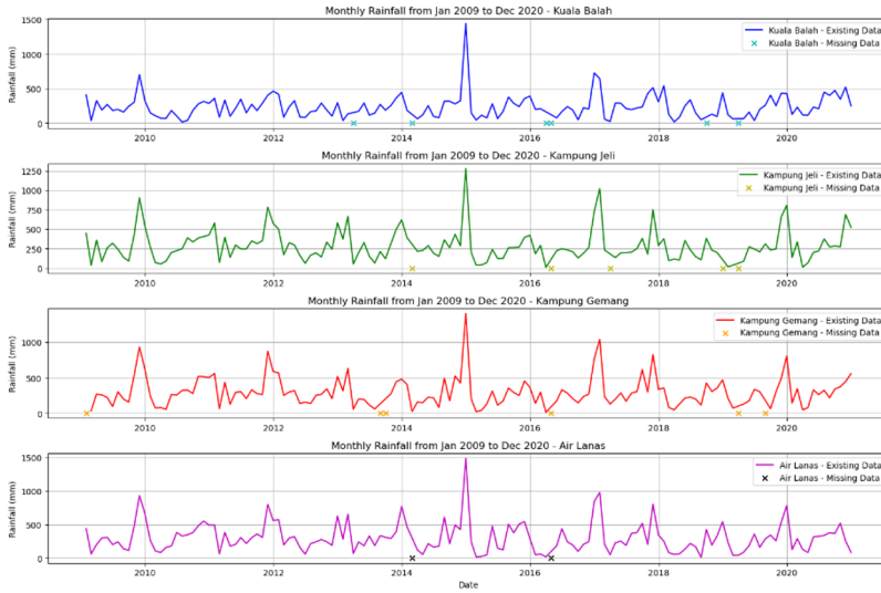
Fig. 2. Monthly rainfall data with missing values.