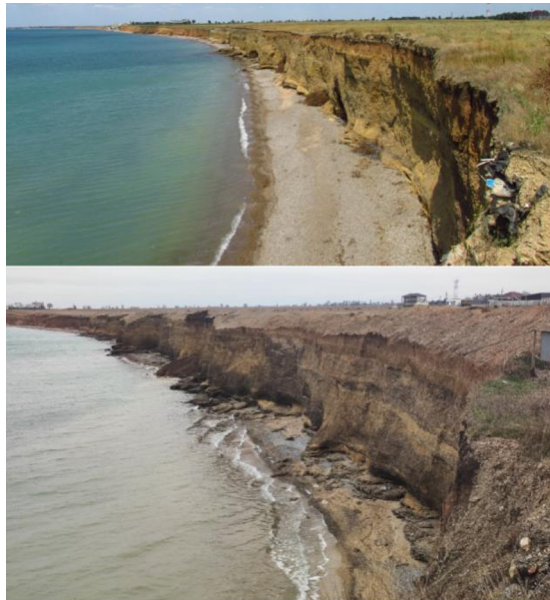
Fig.1. Kalamitsky Bay beaches for 2021 (top) and 2024 (bottom)

The study object are the beaches of the Kalamitsky Bay (Figure 1), located on the territory of the Crimean Peninsula. The bay extends 13 km into the peninsula, and its total length from north to south reaches 41 km.