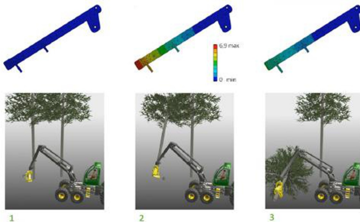
Fig. 5. The upper row shows different deformations of the crane arm. As this was an exemplary study, the results are qualitatively and not absolutely. The time points 1, 2, 3 from Fig. 6 can be directly assigned to characteristic actions of the harvester and the resulting deformations of the crane.

It has to be clarified again, that this application scenario is exemplary and e.g. no hydraulic effects were considered, thus the results of the FEA are qualitatively right, but cannot be quantified. Nevertheless, if the missing information is provided (e.g. by the manufacturer), this can be easily implemented. This is another advantage of the realization via DT, as the same model gets more and more sophisticated while using the same holistic simulation framework.