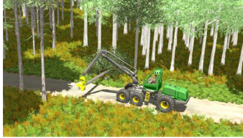
Fig. 4. DT of a harvester in a forest environment cutting a tree.

By fusing all DTs in a holistic scenario, we are able to simulate the interaction of the harvester with its environment via contact forces and friction. This way, the dynamic loads that occur during cutting a tree can be simulated and predicted easily. Emerging from these DTs, we are able to realize the intended application.