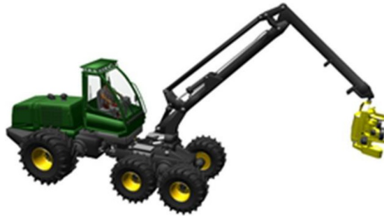
Fig. 2. DT of a Harvester.

In addition, we did not model the actuators based on external forces f_{ext} but based on constraints J \cdot \dot{x} = v_{target} imprinting a desired velocity v_{target} to the system. This way, it is easy to realize desired motions of the crane without the need to emulate the control software, leading to a more efficient DT.