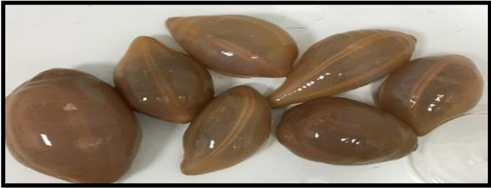
Fig 1. Beronok

phosphorus, offers significant opportunities for improving health, food security, and sustainable living in the region [10][12].